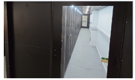
Enclosed hot aisle with in-row coolers

Upto 500 KW of heat re-used for hot water and heating across campus